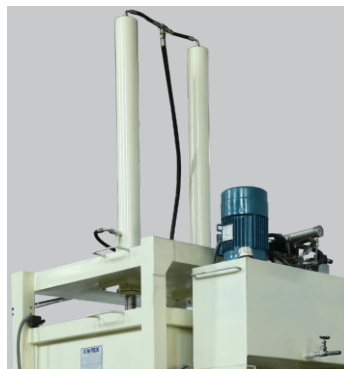
Top Mounted Power Pack